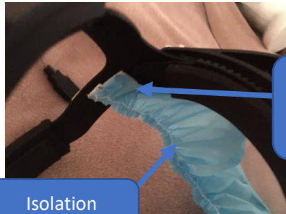
Curtain attached to the inside of headband