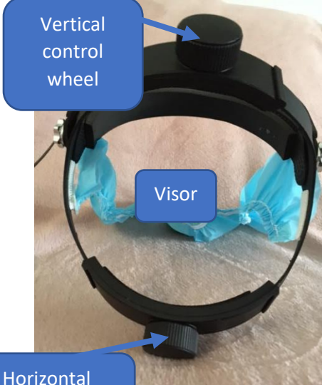
Vertical control wheel