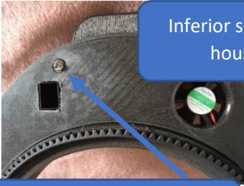
Inferior surface of housing